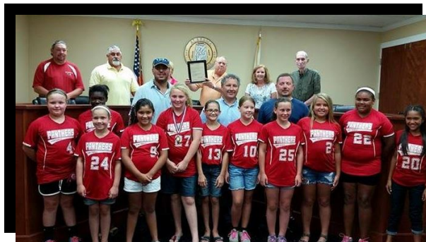
Congratulations to the Collinsville Girls' Softball Ten and Under Team for Winning the Alabama State Tournament